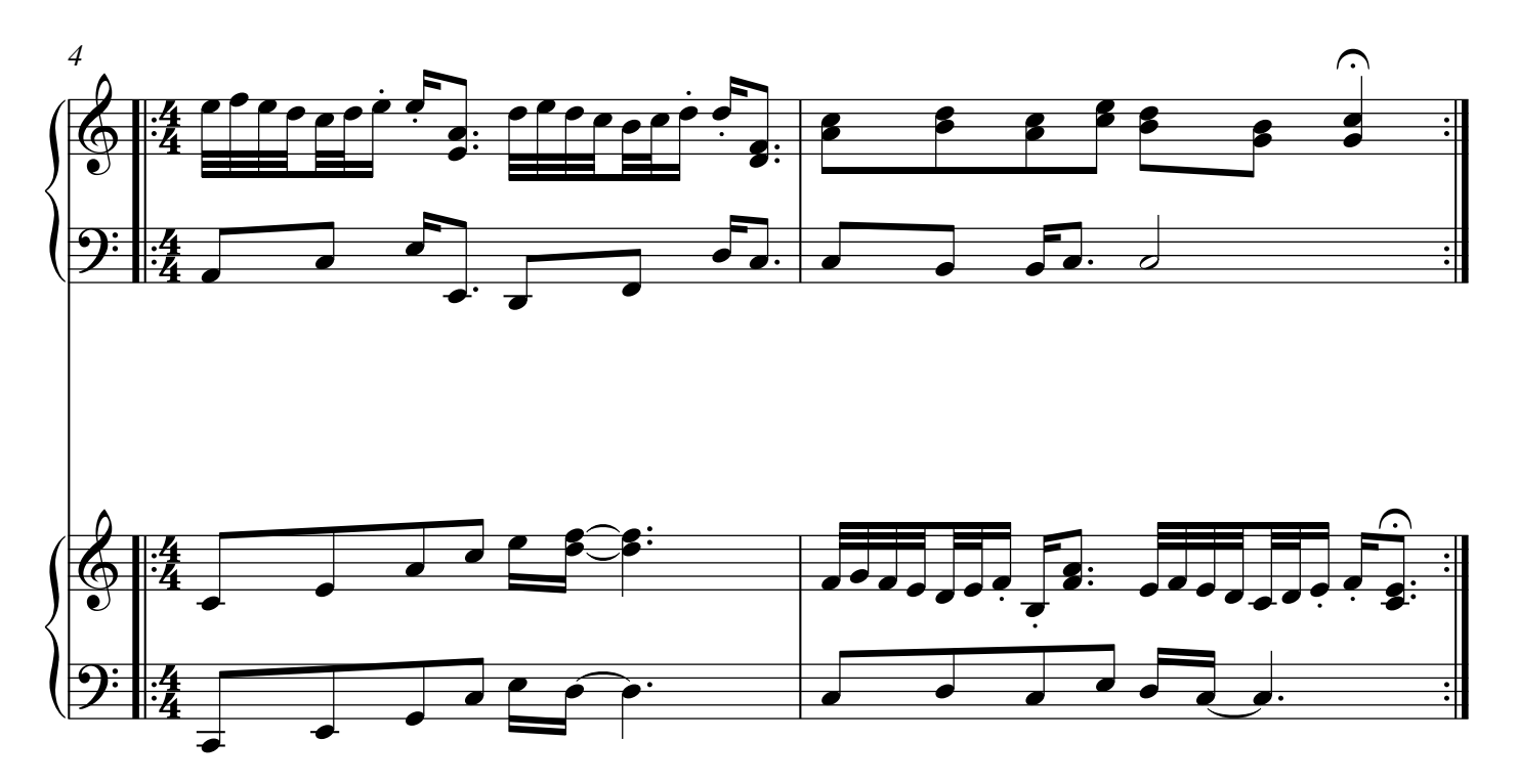
Copyright © Vahan Luder Artinian, August 29, 2019